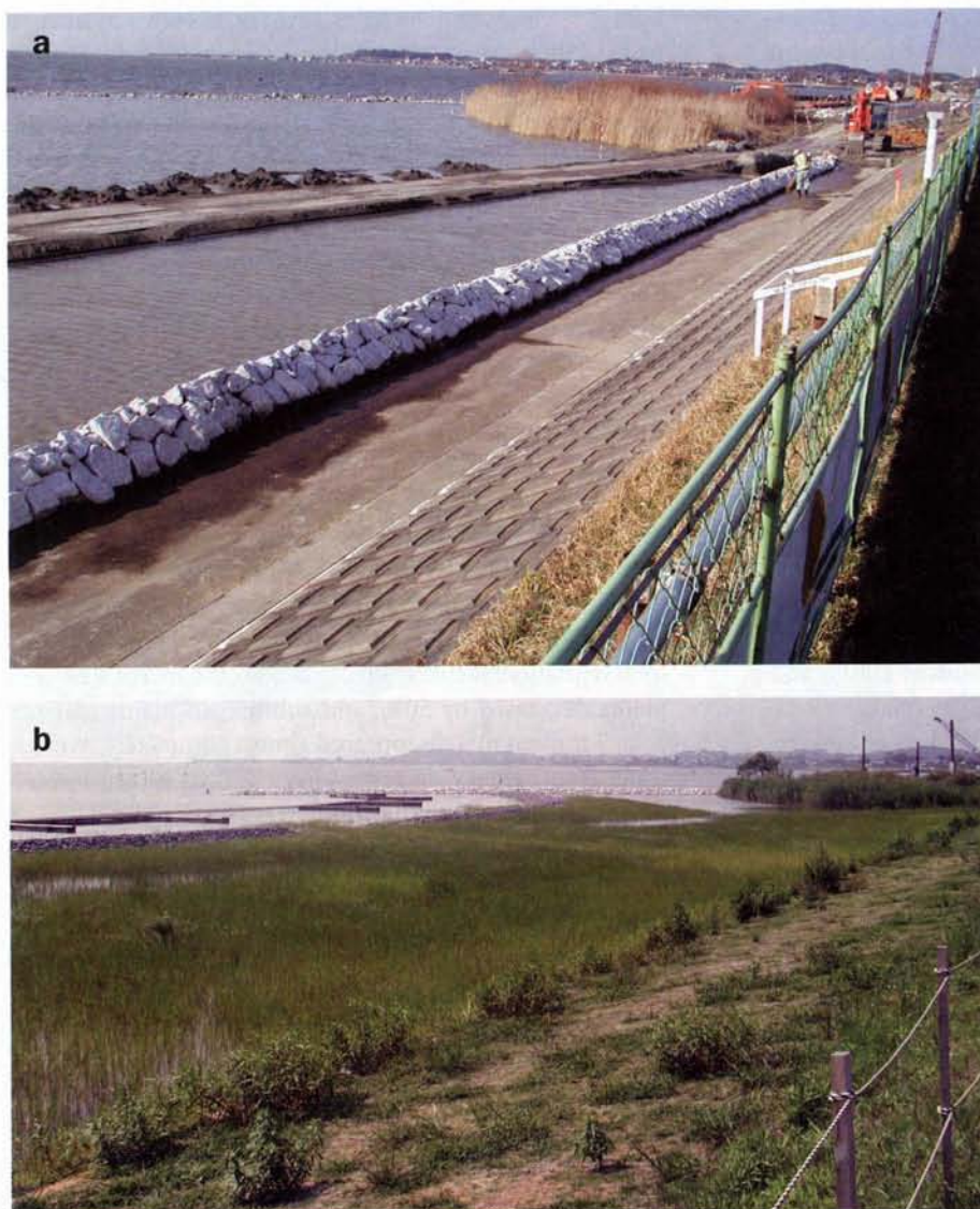
Figure 5. Lake Kasumigaura (a) before and (b) three months after restoration.

restoration. Restored banks were then covered with a 10-cm layer of littoral sediment containing seed banks for vegetation regeneration. Restoration work was completed in spring 2002. The use of natural seed banks led to a rapid recovery of many locally extinct plants (figure 5; Nakamura K 2002, Nishihiro and Washitani 2003). Indeed, some plant species reappeared after 30 years of virtual absence (table 1).