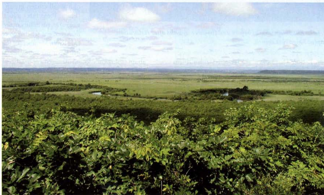
Figure 4. The Kushiro Mire (Hokkaido) is the largest wetland in Japan.

Lake Kasumigaura, 60 km northeast of Tokyo, is the second largest lake in Japan (220 km 2 ). It is a shallow lake (on average 4 m deep) that drains a densely populated catchment (2157 km 2 , with a population of about one million people). Eutrophication, bank stabilization, and a controlled water level for flood management and for securing water for households, industry, and agriculture have heavily damaged the littoral vegetation. Between 1970 and 2000, the area of emergent plants decreased by 50%, and submerged plants (former area: 7 million m 2 ) disappeared almost completely. Average water transparency decreased from 150 to 30 centimeters (cm). The main turning point was the rapid decline of Nymphoides peltata , or yellow floating heart. In 2001, the Kasumigaura River Office (a branch of the MLIT) initiated large-scale lakeshore restoration measures to conserve N. peltata and to restore lake littoral zones. The project involves close cooperation among stakeholders, engineers, and ecologists. The alignment and slope of the banks were designed using old maps and photos and information from reference lakes. Excavated offshore bottom sediments were used for