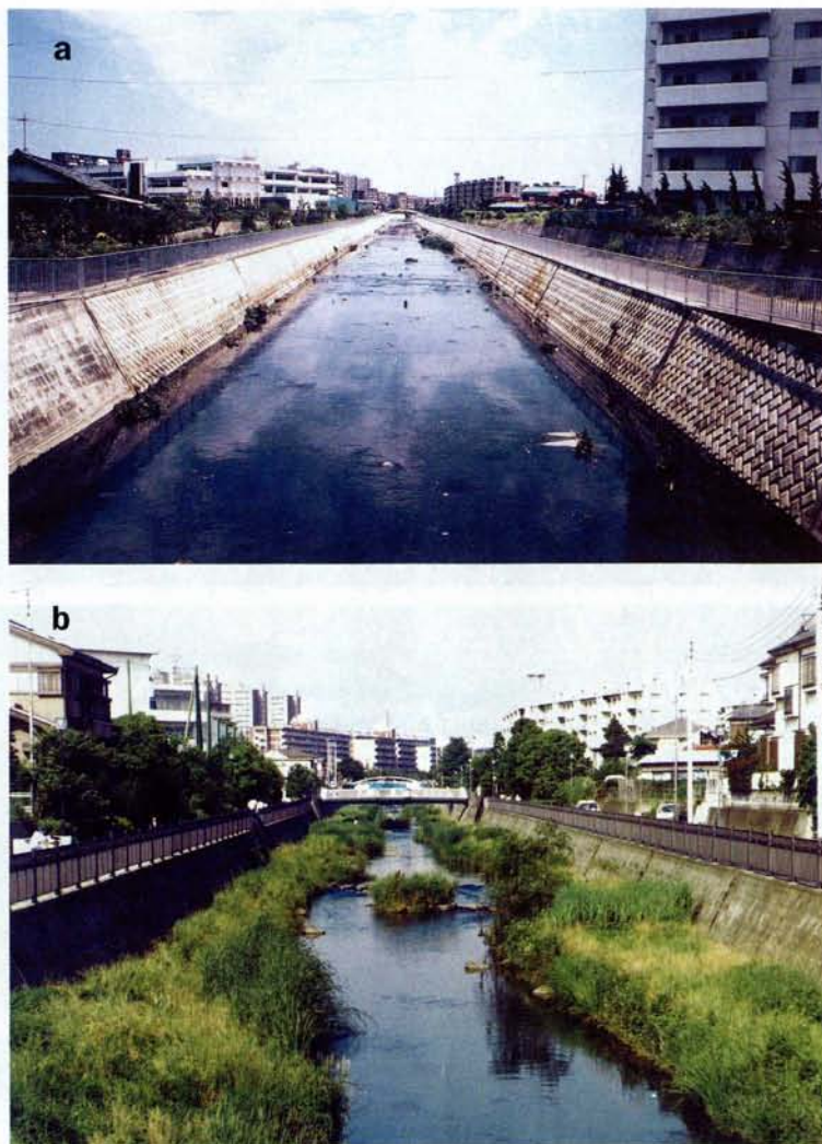
Figure 2. The Itachi River (a) before restoration (1981) and (b) after restoration (1993).

Tama River. The 136-km-long gravel-bed Tama River (Tokyo region) exemplifies the typical problems of most Japanese rivers: a high degree of urbanization, dam construction and flow regulation, gravel excavation, loss of exposed gravel sediments, and massive invasion by exotic plants (Shimatani 2003). The catchment covers 1249 km 2 with a human population of 4.4 million (average density: 3000 people per km 2 ). During the past few decades, the river has evolved from a large, braided gravel-bed river to a single-thread, incised channel fringed by densely forested terraces (figure 3). This geomorphic transformation was caused by (a) gravel excavation during the rapid economic growth period in the 1950s and 1960s; (b) a decline in sediment supply from upstream sections; (c) flow control by the Hamura weir, located 0.5 km upstream; and (d) fine sediment deposition along the incised channel (Lee et al. 1999, Minagawa and Shimatani 1999, Shimatani 2003). As a result, native plants and animals typical of bare sediments (e.g., Aster kantoensis ) disappeared almost completely, while nonnative woods (e.g., Robinia pseudoacacia ) rapidly expanded (Kurahara et al. 1992).