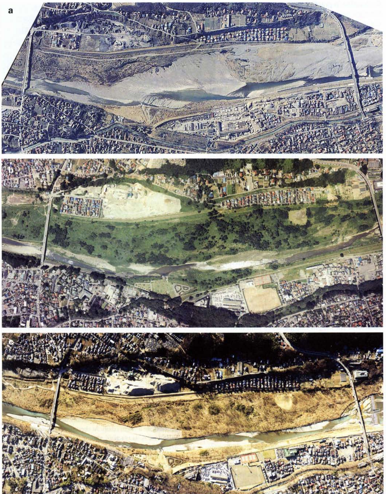
Figure 3. The Tama River (Tokyo) (a) before major river incision (1974), (b) after river incision (1996), and (c) after restoration (2002).